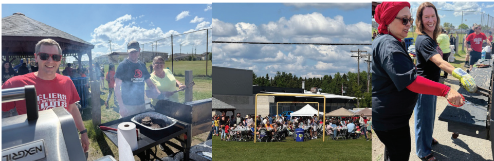
Local 8223 Handing Out Ice Cream Bars to Evacuees