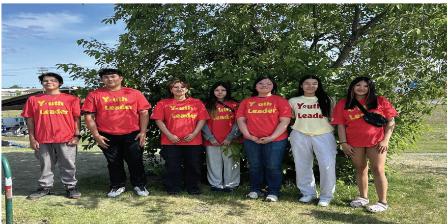
Ecole Riverside School Barbeque